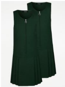
BOTTLE GREEN PINAFORE