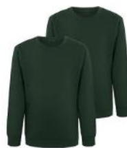
BOTTLEGREEN JUMPER (BOYS)