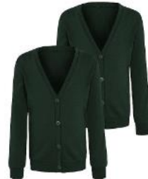
BOTTLE GREEN CARDIGAN