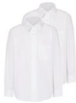
WHITE FULL SLEEVE SHIRT