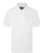
WHITE POLO T-SHIRT