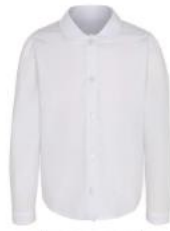
WHITE FULL SLEEVE BLOUSE