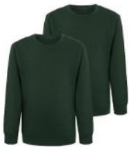
BOTTLE GREEN SWEATSHIRT