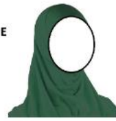
BOTTLE GREEN HEAD SCARF