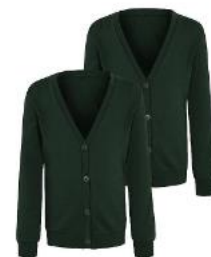
BOTTLE GREEN CARDIGANS (GIRLS)